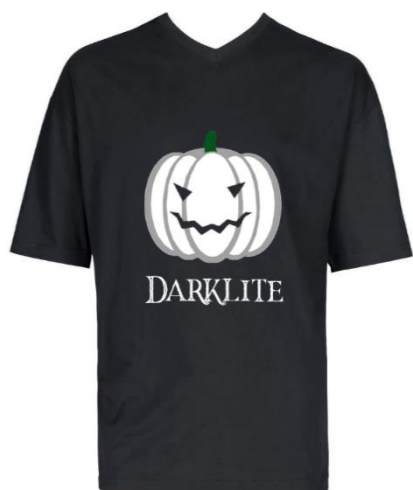
How it looks in a standard environment